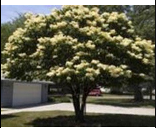
Snow Dance Tree

Syringa reticulata subsp. reticulata 'Bailnce' (Snow Dance)